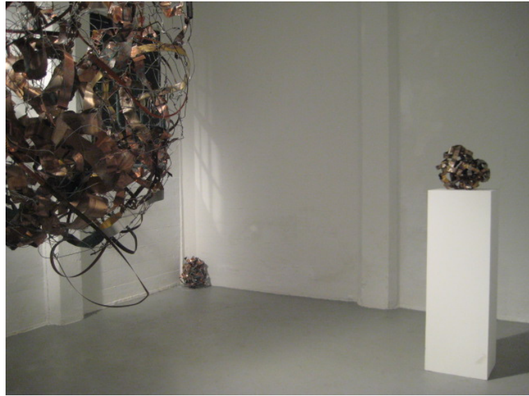
Installation view, Abaton Garage August - September 2007