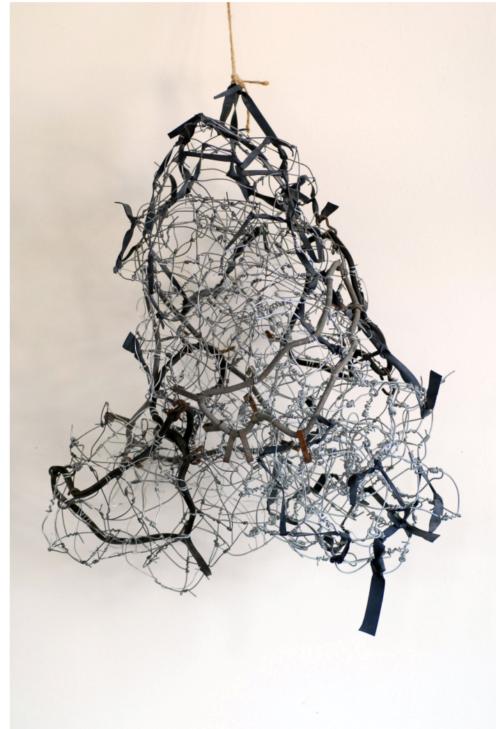
Amoral , 26 x 19 x 20 in., wire, rubber, 2007