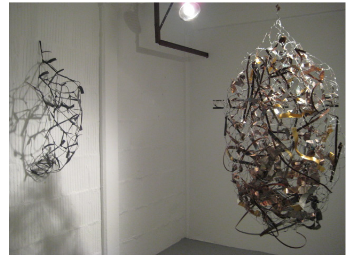
Installation view, Abaton Garage August - September 2007