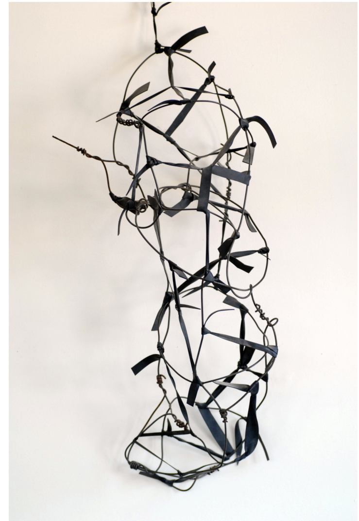
Extraction, 40 x 16 x 11 in., wire, rubber, 2006